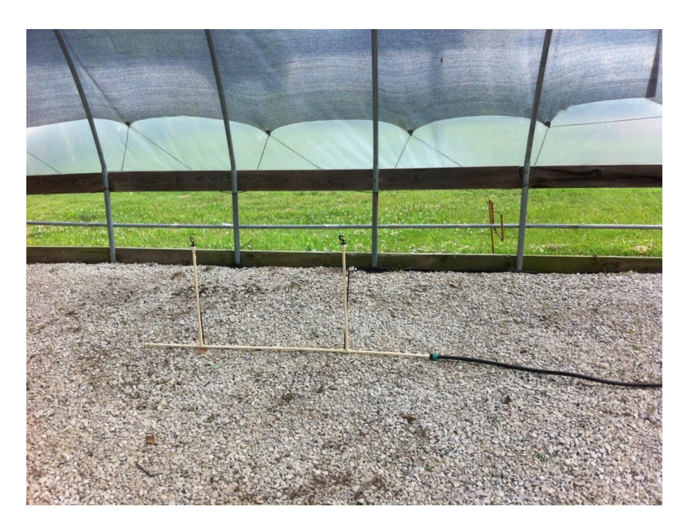
Mist system attached to two sections of rebar with zip ties.