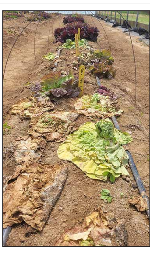
FIGURE 2. FIELD IMAGE FROM 2023 SHOWS PLANTS AFFECTED BY LETTUCE DROP IN THE MID PLANTING DATE TREATMENT. IN THE FOREGROUND, CUITIVAR HARMONY FROM EARLY PLANTING DATE (64 DAYS AFTER PLANTING and 10 days AFTER HARVEST), FOLLOWED BY MID PLANTING DATE CULTIVARS PIRAT. HARMONY. GALACTIC, AND VULCAN (44 DAYS AFTER PLANTING).