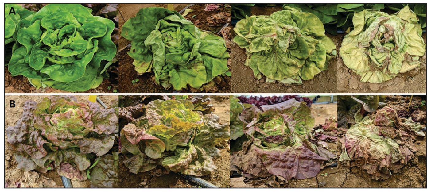
FIGURE 1. PROGRESSION OF LETTUCE DROP SYMPTOMS (LEFT TO RIGHT) ON CULTIVARS (A) HARMONY AND (B) PIRAT PLANTED IN A HIGH TUNNEL IN LEXINGTON, KENTUCKY

Soil water did not consistently affect lettuce drop incidence or yield, but planting date and cultivar consistently affected incidence in both years.