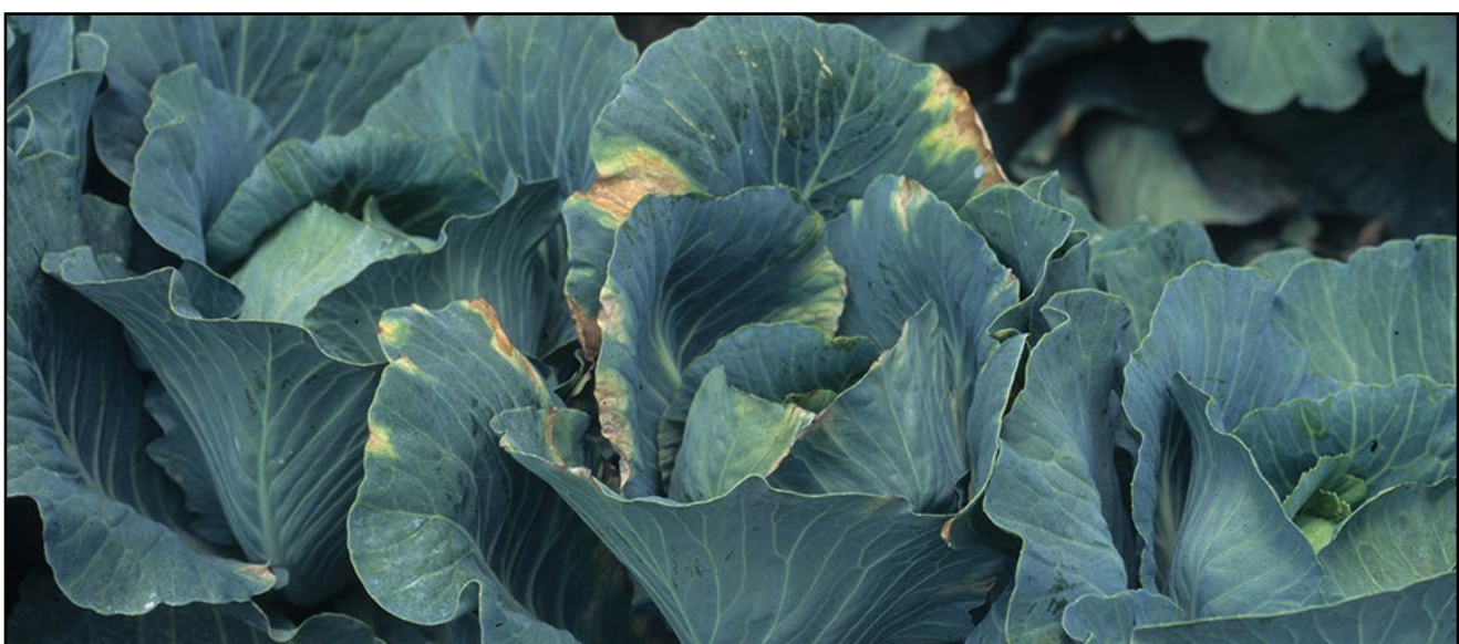
Agriculture & Natural Resources • Family & Consumer Sciences • 4-H/Youth Development • Community & Economic Development

Initial symptoms appear as distinct, yellow V-shaped lesions along leaf margins, with the bottom of each "V" pointing inward (FIGURE 2). Lesions turn brown as they become necrotic (dead) (FIGURE 3), enlarging until entire leaves yellow, wilt, and fall from plants. Leaf veins in affected areas turn from green to darkbrown to black.