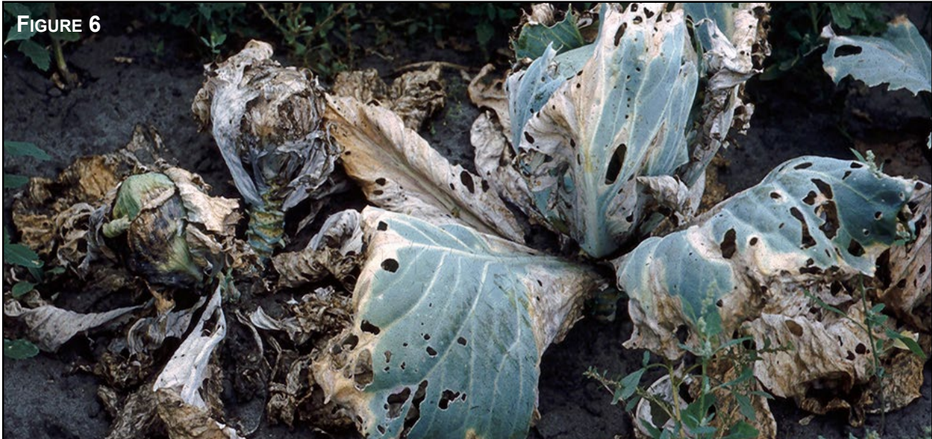
FIGURE 6. SOFT ROTTING BACTERIA INVADE AND COLONIZE INFECTED PLANTS, RESULTING IN FURTHER DECAY AND LOSS OF HEADS. HOLES IN LEAVES ARE THE RESULT OF CATERPILLAR FEEDING.

FIGURE 5. BLACKENING OF VEINS IS EVIDENT WHEN INFECTED CABBAGE HEADS ARE CUT.