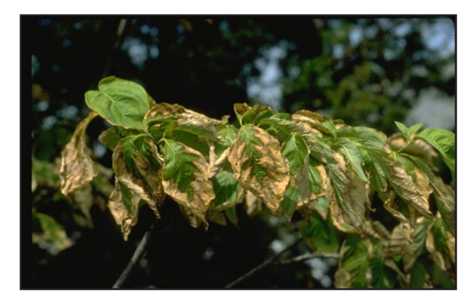
FIGURE 1 . LEAF SCORCH SYMPTOMS MAY APPEAR ON INDIVIDUAL BRANCHES OR OVER THE ENTIRE PLANT.

Foliar symptoms differ for deciduous woody plants (drop their leaves during autumn, e.g. maple) and needled evergreens (retain their foliage during winter, e.g. pine). Symptoms on broadleaf evergreens (e.g. southern magnolia, FIGURE 8), are similar to those due to winter drying and are described later in this fact sheet.