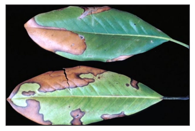
FIGURE 8 . TYPICAL WINTER DRYING SYMPTOMS ON MAGNOLIA LEAVES.

Symptoms may not become apparent until late winter or early spring. Affected leaves dry out and turn brown along margins and at tips (FIGURE 8). Often foliage droops and the plant has an overall wilted appearance. Winter drying may also lead to dieback of twigs.