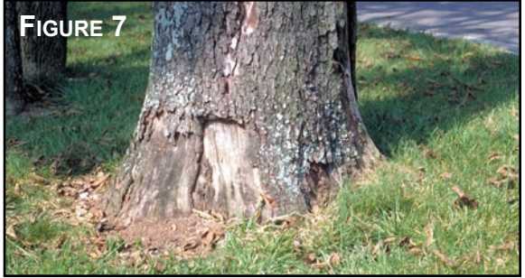
FIGURE 5. CANKER DISEASES RESTRICT WATER FLOW TO FOLIAGE, RESULTING IN LEAF SCORCH SYMPTOMS. FIGURE 6. EARLY SYMPTOMS OF PHYTOPHTHORA ROOT ROT (IN THIS CASE, ON OAK) MAY APPEAR AS LEAF SCORCH. FIGURE 7. TRUNK INJURIES DUE TO CONSTRUCTION, MOWERS, AND OTHER CAUSES INTERFERE WITH WATER MOVEMENT TO BRANCHES AND FOLIAGE.

• Gas leaks —oxygen is forced out of soil when underground gas leaks occur, causing roots to suffocate from lack of oxygen.