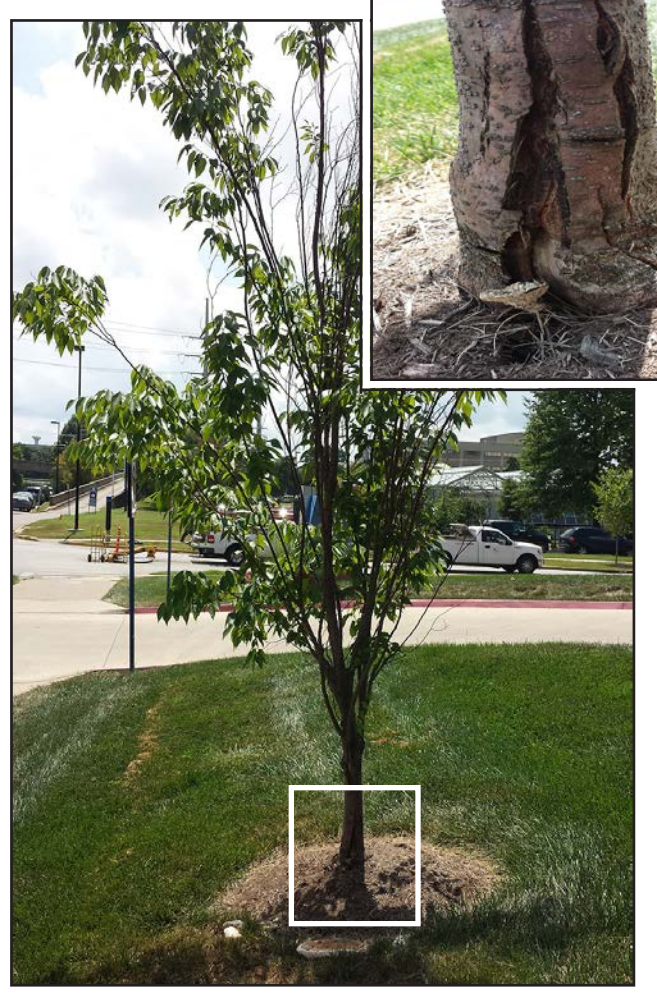
FIGURE 1. PHOTOS THAT INCLUDE THE ENTIRE PLANT AND CLOSE-UPS OF PLANT PARTS (INSET) ARE HELPFUL IN THE DIAGNOSTIC PROCESS.