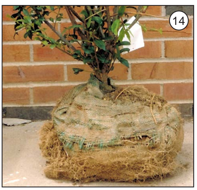
FIGURE 13. HEALTHY ROOTS (LEFT) ARE MORE NUMEROUS AND LIGHTER IN COLOR THAN DECAYED ROOTS (RIGHT). FIGURE 14. SYNTHETIC BURLAP LEFT ON ROOT BALLS AT PLANTING RESTRICTS ROOT GROWTH.

After assessment of the affected plant and surrounding area, it may be necessary to submit a sample to a University of Kentucky Plant Disease Diagnostic Laboratory. Information gathered using this guide may be helpful to include with the submission form. For information on sample submission, see Submitting Plant Specimens for Disease Diagnosis (PPFS-GEN-09).