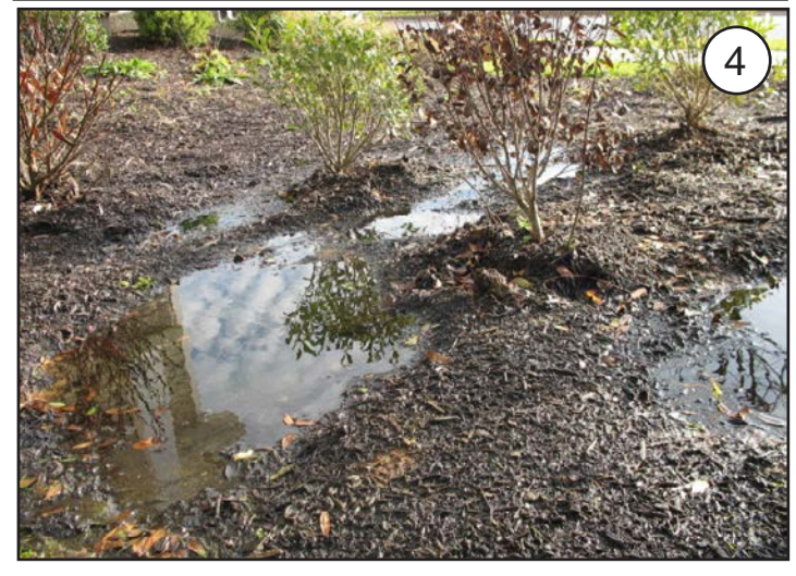
FIGURE 2. ASSESS TYPE(S) OF PLANTS AFFECTED AND SITES FOR A PATTERN.

FIGURE 3. GRADE CHANGES (ADDITION OR REMOVAL OF SOIL) CAN ADVERSELY AFFECT TREE HEALTH.