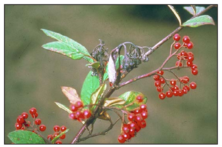
FIGURE 6. FIRE BLIGHT SYMPTOMS ON COTONEASTER RESEMBLE THE DISTINCTIVE SYMPTOMS FOUND IN APPLE AND PEAR.