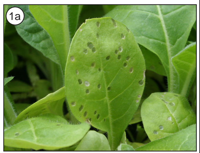
FIGURE 1: LESIONS OF TARGET SPOT (a) AND FROGEYE LEAF SPOT (b) ON BURLEY TOBACCO TRANSPLANTS IN THE GREENHOUSE.

Target spot and frogeye leaf spot (frogeye) can cause disease in greenhouse transplants (FIGURES 1a & 1b; Dixon et al. 2018). Both diseases may become severe more quickly when symptomatic plants are transplanted in the field (FIGURE 2). While in the field, target spot and frogeye lesions occur on the lowest, oldest leaves first, then progress to upper leaves over time. Visual symptoms of these diseases differ, as described below.