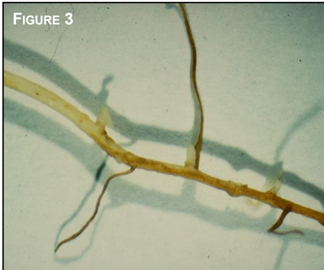
FIGURE 3. APHANOMYCES DAMAGES FINE FEEDER ROOTS IN SATURATED SOILS.

Aphanomyces (FIGURE 3) and Pythium species are also known to attack the fine feeder roots of mature plants of alfalfa when soils are saturated. Always select varieties that have resistance to Phytophthora and Aphanomyces root rots when seeding alfalfa in Kentucky. Unfortunately, there is no known resistance in commercial cultivars to Pythium infection, but improving soil drainage and minimizing soil compaction will help with all three diseases.