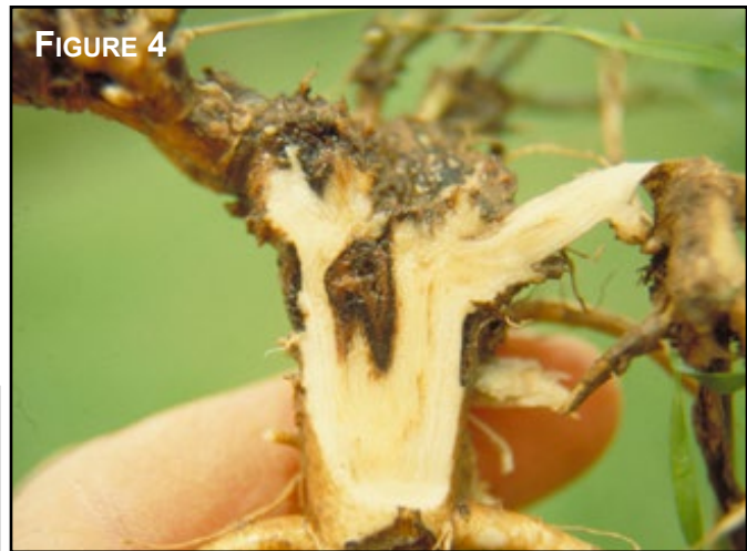
FIGURE 4. DECAY IN ALFALFA CROWNS IS INDICATIVE OF A CROWN ROT DISEASE.

Assessing stand density can help determine when to rotate to a different forage crop. Guidelines for assessing stand based on crown density or stem density are described below. These are only approximate guidelines. For example, a beef cattle producer often will meet his/her production goals with a much lower density of alfalfa crowns than a hay producer. If stands are less than what is needed to reach yield goals, rotate away from alfalfa for at least 1 year before re-seeding to alfalfa again.