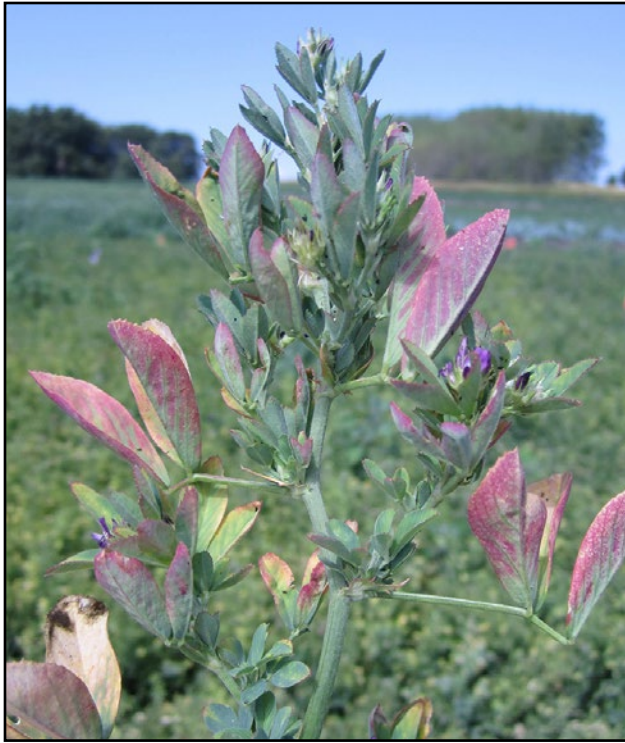
FIGURE 8. LEAFHOPPER FEEDING MAY ALSO RESULT IN REDDISH/PURPLISH FOLIAGE.