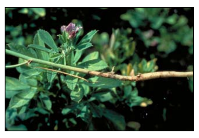
FIGURE 1. RHIIZOCTONIA STEM CANKER

Taproots may exhibit brown to black cankers when invaded by Rhizoctonia solani . Another species, Rhizoctonia crocorum , causes