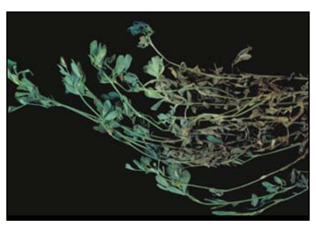
FIGURE 4. SYMPTOMS CHARACTERISTIC OF WEB BLIGHT

Rhizoctonia diseases of alfalfa are quite common in Kentucky, as our warm, humid climate is very favorable for these fungi. Poor drainage and excessive top growth can also encourage disease development. Undecomposed organic matter, particularly if it is high in nitrogen, is another factor which may promote Rhizoctonia diseases. For example, these diseases are sometimes more severe where sod is plowed under or where manure is spread during warm, humid weather.