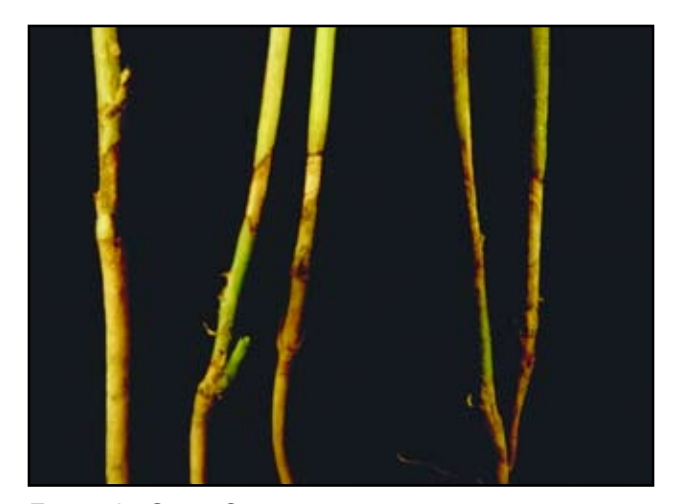
FIGURE 2. STEM CANKER LESIONS

on infected stems wilt and turn yellow, sometimes with reddening.