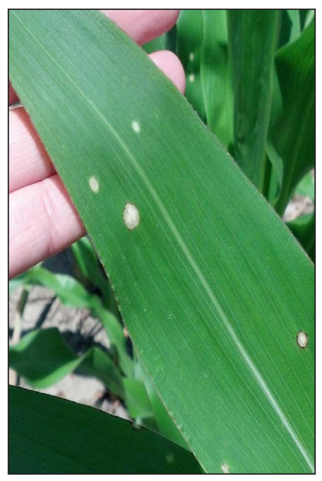
FIGURE 1. HOLCUS LEAF SPOT LESIONS.

One of the challenges to diagnosing holcus leaf spot is that the disease symptoms can be confused with exposure to off-target movement of contact-type herbicides. Paraquat is one example of a broadspectrum contact herbicide, meaning that it has efficacy on all plant species and only affects the parts