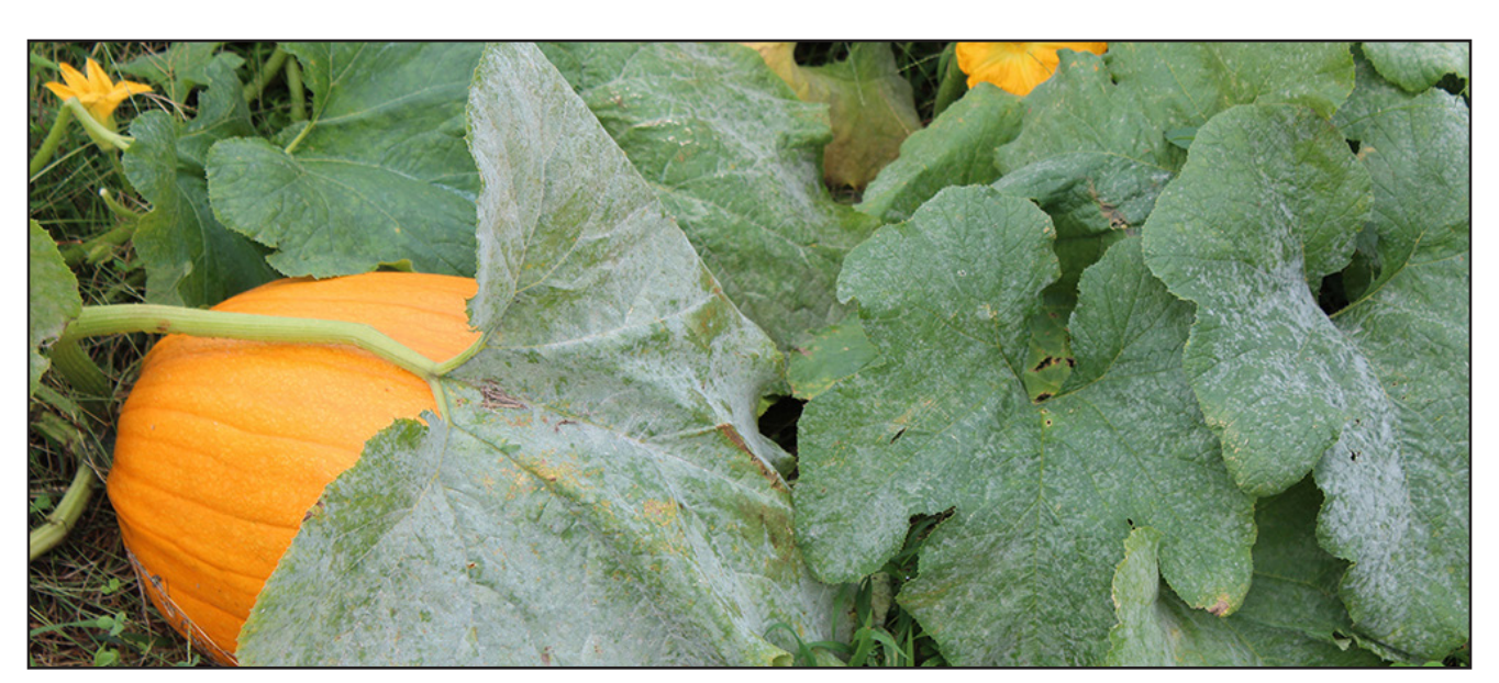
FIGURE 1. POWDERY MILDEW ON PUMPKIN FOLIAGE.

Powdery mildew is easily identified by the presence of white, tan, or gray powdery fungal growth (mycelium and spores) that is present primarily on surfaces of infected plant parts. Immature plant parts are often most susceptible. Affected leaves (FIGURES 1 to 3),