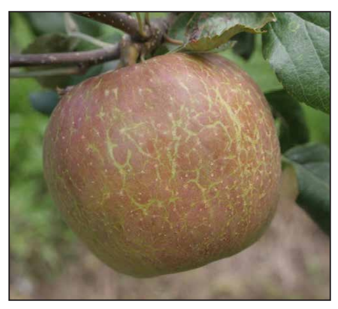
FIGURE 7 . EARLY INFECTIONS OF APPLE FRUIT RESULT IN NET-LIKE RUSSETTING AS FRUIT MATURES.

severely infected leaves drop prematurely. Fruit may be misshapen, fail to color properly, become russetted (FIGURE 6), or split open. Fruit of many vegetables do not become infected, but powdery mildews can still reduce yield and/or quality.