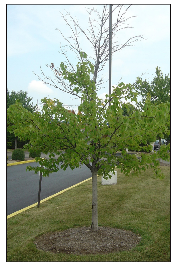
FIGURE 1. DIEBACK DUE TO TRANSPLANT SHOCK OFTEN BEGINS WITH DEATH OF SCATTERED LIMBS.

If trees fail to regenerate new, healthy roots or fail to establish root systems in new planting sites, transplant shock often results. Such root-related problems may be traced to one or more factors: stresses which occurred when plants were removed from original sites, injury during transit, improper planting techniques, and/or poor cultural practices.