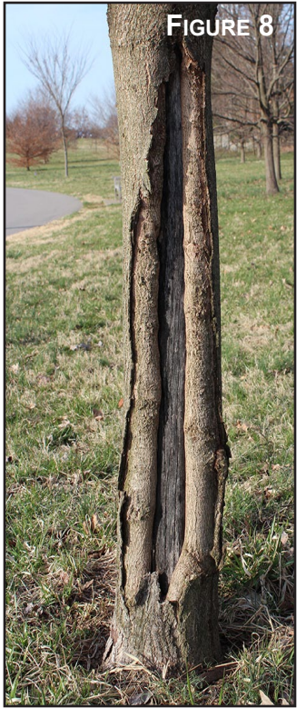
FIGURE 8. SUNSCALD DAMAGE OCCURS DURING EARLY SPRING ON THIN-BARKED TREES.

FIGURE 9. MOWER DAMAGE CAUSES WOUNDS THAT GIRDLE TRUNKS.