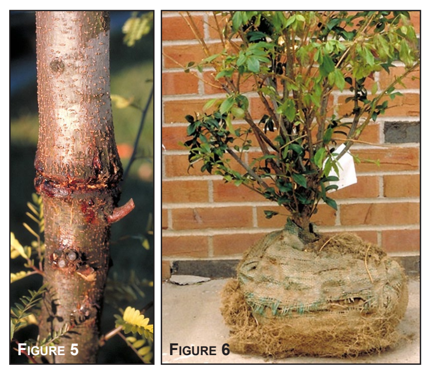
FIGURE 6. BURLAP DOES NOT READILY DEGRADE IN PLANTING HOLES AND SHOULD BE REMOVED FROM PLANTS BEFORE INSTALLATION. THIS SYNTHETIC "BURLAP" MATERIAL PREVENTED ROOTS FROM EXPANDING BEYOND THE ORIGINAL ROOTBALL.

Figure 5. Wire from tags and guides can girdle branches and trunks if not removed at time of planting.