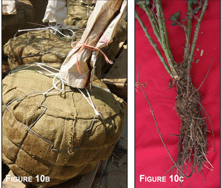
FIGURE 10. PLANTING MATERIAL IS AVAILABLE AS (A) CONTAINER GROWN, (B) BALLED-AND-BURLAPPED OR (C) BAREROOT.

Trees and shrubs should be installed as soon as possible after delivery, regardless of whether they are container-grown or field-dug. Plant material should be protected from physical damage, freezing