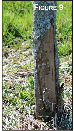
FIGURE 9. MOWER DAMAGE CAUSES WOUNDS THAT GIRDLE TRUNKS.

FIGURE 8. SUNSCALD DAMAGE OCCURS DURING EARLY SPRING ON THIN-BARKED TREES.