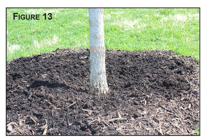
FIGURE 13. MULCH IS SPREAD ACROSS ENTIRE ROOT ZONE AND PULLED AWAY FROM TRUNK.