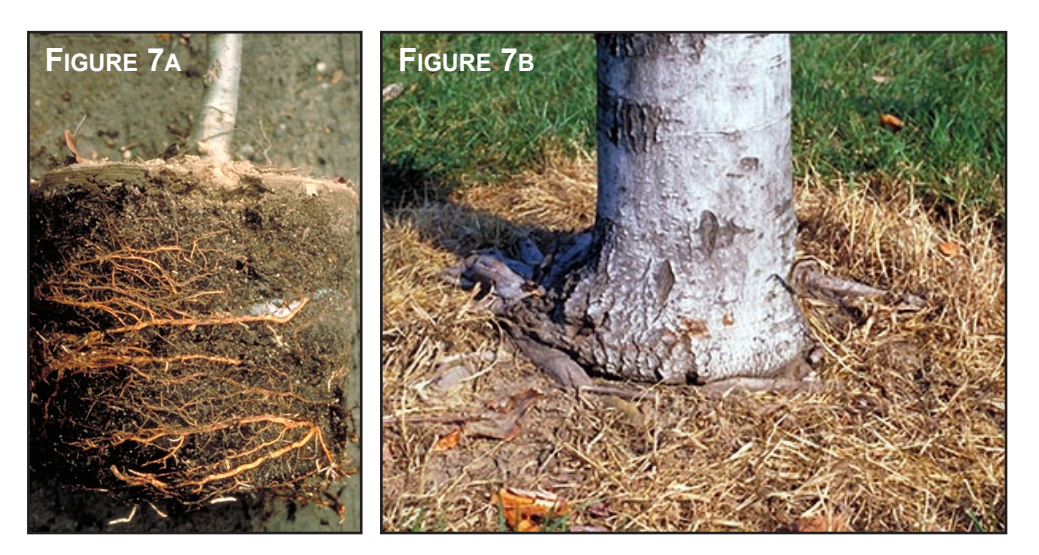
FIGURE 7A. ENCIRCLING ROOTS OFTEN CONTINUE THIS GROWTH HABIT AFTER INSTALLATION.

Prevention is the key to minimizing transplant shock. Only healthy, hardy landscape material should be purchased and installed into landscapes. The following steps are important for reducing transplant stress and may reverse transplant shock symptoms: