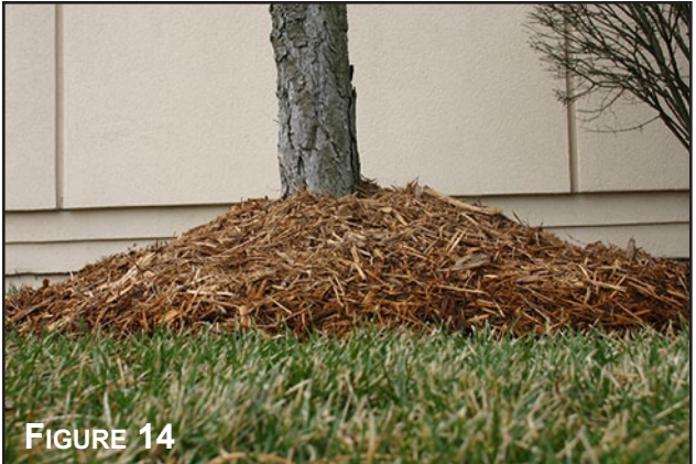
FIGURE 14. "VOLCANO" MULCH IS CHARACTERIZED BY HIGH NARROW PILES AROUND TRUNKS.