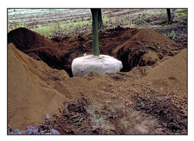
Figure 12. Backfill should consist of naturally occurring soil, not amendments or artificial media.

Mulch is an important part of planting and caring for landscape trees and shrubs. Add a layer of organic mulch (bark, wood chips, pine straw) 2 to 3 inches deep over entire root zone (FIGURE 13). Mulch helps: