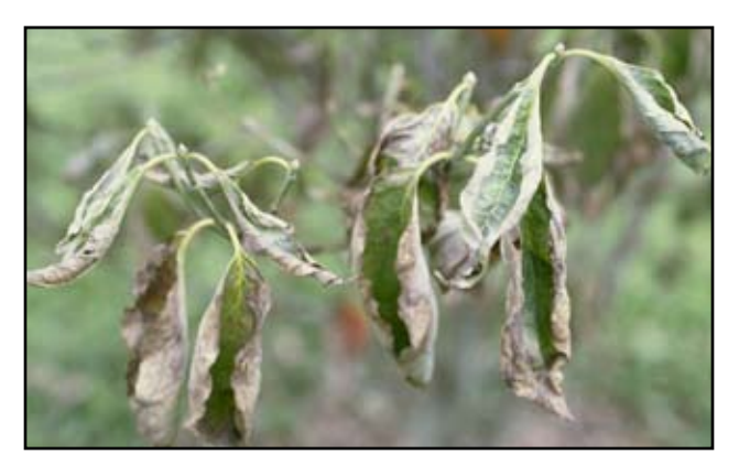
FIGURE 4. DROOPING, SCORCHING AND CUPPING OF LEAVES ARE COMMON SYMPTOMS.

canker. The long-term effects of powdery mildew disease development on tree health are not known. Most landscape dogwoods are grown from seedling sources, so the mildew susceptibility of individual dogwood trees in landscapes varies greatly.