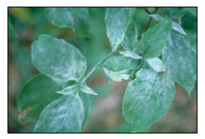
FIGURE 1. THE PRESENCE OF A WHITE POWDERY FUNGAL GROWTH IS THE DISTINGUISHING FEATURE OF THIS DISEASE.

Later in the season, the tips and edges of infected leaves may be scorched, cupped, and drooped (FIGURE 4), with badly infected leaves falling prematurely. Throughout the season, the typical white powdery fungal mycelium and spores may develop abundantly on new growth, distorting and