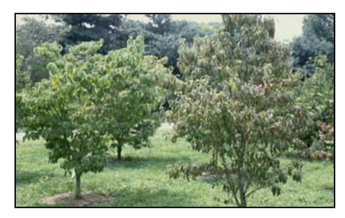
FIGURE 6. THE UNSPRAYED TREE (R) IS INFFECTED WITH POWDERY MILDEW, WHILE THE SPRAYED TREE (L) APPEARS HEALTHY.