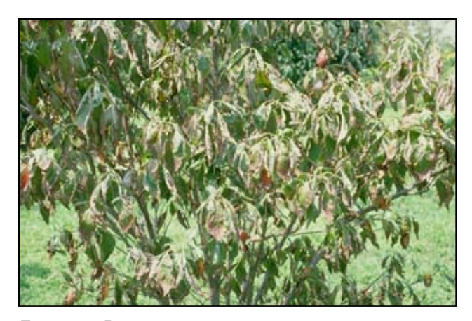
FIGURE 5. BY FALL THE FOLIAGE OF INFECTED DOGWOODS MAY BE VERY UNHEALTHY ON SUSCEPTIBLE TREES.