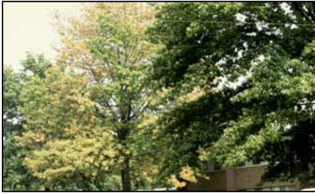
FIGURE 2. BACTERIAL LEAF SCORCH CAUSES PREMATURE BROWNING OF PIN OAK (L) COMPARED TO UNAFFECTED TREE (R).

Leaf tissue can be tested for the presence of the bacterium at the University of Kentucky Plant Disease Diagnostic Laboratory.