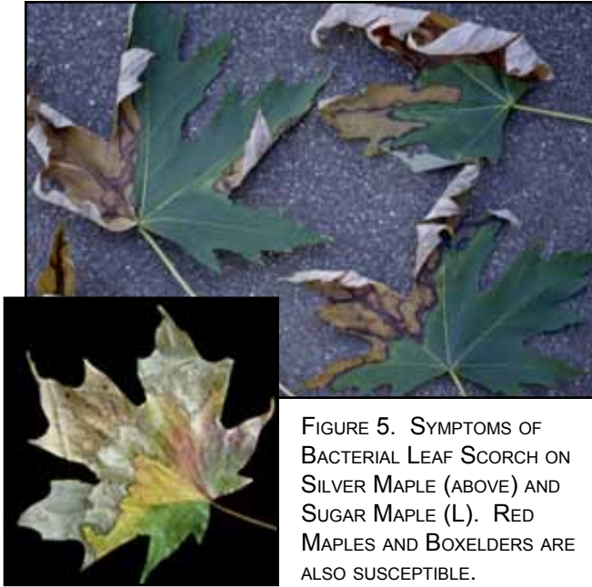
FIGURE 5. SYMPTOMS OF BACTERIAL LEAF SCORCH ON SILVER MAPLE (ABOVE) AND SUGAR MAPLE (L). RED MAPLES AND BOXELDERS ARE ALSO SUSCEPTIBLE.

be gradually lost over the years. Because infected trees decline gradually, it may be 5 to 10 years before there are many dead limbs and branches present. In the meantime, tree owners can provide good growing conditions for the trees to prolong their survival and to enhance their aesthetic value.