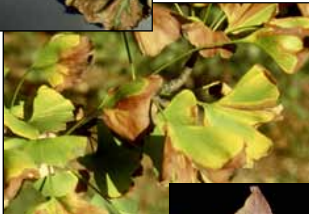
FIGURE 6. OTHER TREES SUSCEPTIBLE TO BACTERIAL LEAF SCORCH INCLUDE (TOP TO BOTTOM) SYCAMORE, GINKGO AND SWEETGUM

catastrophic tree losses due to diseases or insects, avoid planting all the same tree species in a neighborhood, or a community. Select trees that do well in