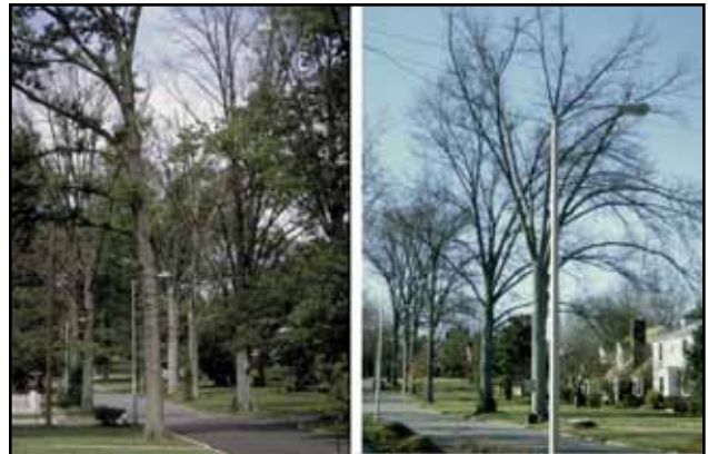
FIGURE 4. STREET TREE PIN OAKS BEGIN TO SHOW DECLINE DUE TO BACTERIAL LEAF SCORCH (L), WITH COMPLETE LOSSES OCCURING A FEW YEARS LATER (R).

Bacterial leaf scorch is found throughout much of the eastern and southern U.S. In Kentucky, it is present in landscape trees in many urban areas, including Paducah, Madisonville, Owensboro, Bowling Green, Somerset, Louisville, and Lexington. This disease has not been detected in Kentucky's forest trees.