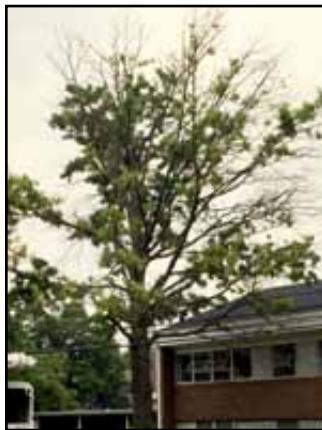
FIGURE 3. PIN OAK WITH BRANCH DIEBACK RESULTING FROM CHRONIC BACTERIAL LEAF SCORCH DISEASE.

Bacterial leaf scorch is caused by the bacterium Xylella fastidiosa . This bacterium is spread by leafhoppers and treehopper insects, although it does not appear to be spread from tree to tree very rapidly. Nevertheless, in some neighborhoods where the disease has been present for many years, a high proportion of mature oaks may show symptoms of bacterial leaf scorch (FIGURE 4). Little is known about which of these leafhopper vectors are active in Kentucky. There is some evidence that X. fastidiosa is present in symptomless shrubs,