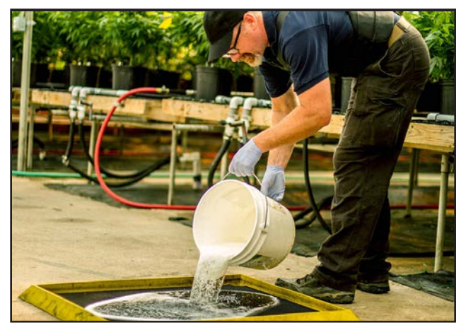
FIGURE 4. FOOTBATHS SHOULD BE FILLED WITH COMMERCIAL SANITIZING SOLUTION, AND THE SOLUTION SHOULD BE CHANGED REGULARLY.

Next, clean and sanitize all surfaces, including greenhouse sidewalls, groundcovers or floors (FIGURE 2), benches, containers, tools, equipment, irrigation lines, and breaker nozzles or heads, in order to inactivate any remaining propagules.