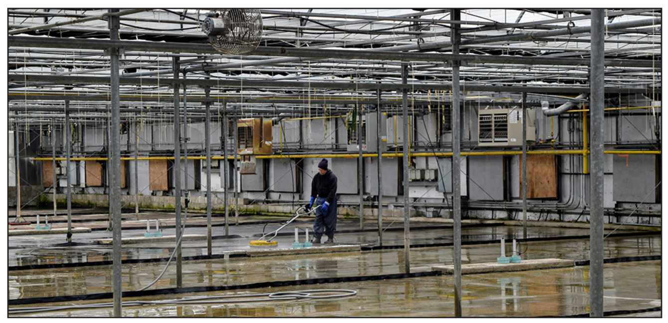
FIGURE 1. GREENHOUSES SHOULD BE EMPTIED, CLEANED, AND SANITIZED BETWEEN CROPS IN ORDER TO ELIMINATE DISEASE-CAUSING PATHOGENS.

The following cleaning and sanitation protocol applies to all commercial greenhouses, regardless of size.