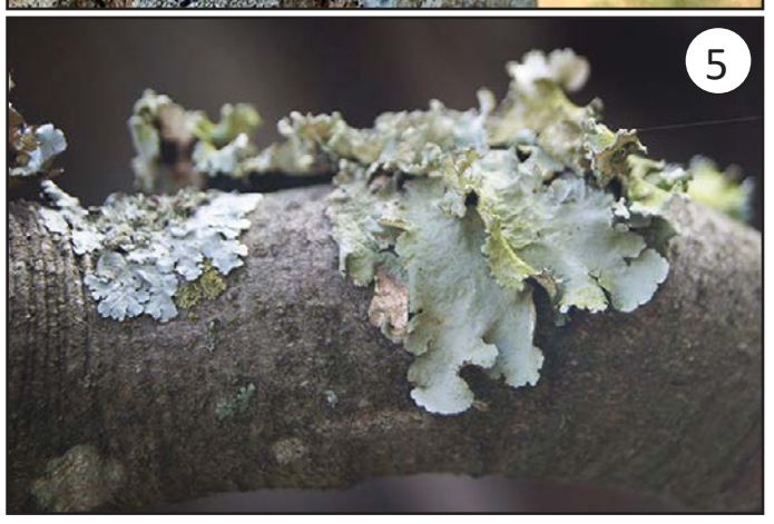
FIGURE 3. A GREEN LICHEN IN THE PARMELIACEAE FAMILY WITH FOLIOSE GROWTH HABIT WAS LOCATED ON A DECLINING SILVER MAPLE TREE WITH ARMILLARIA ROOT ROT. THIS FAMILY OF LICHENS IS VERY COMMON AND EXTREMELY DIVERSE.

FIGURE 4 . THE GREEN SHIELD LICHEN ( FLAVOPARMELIA CAPERATA ; PARMELIACEAE FAMILY) HAS A FOLIOSE GROWTH HABIT AND IS FOUND HERE ON A STRESSED TREE.