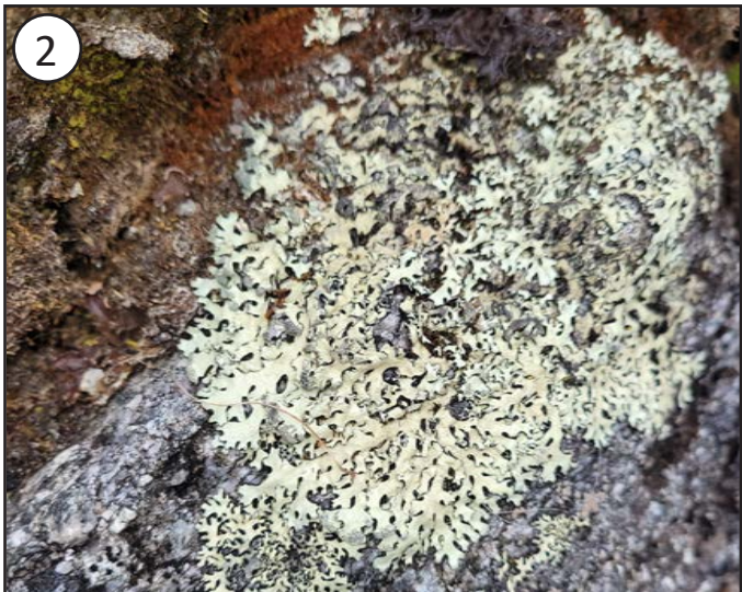
FIGURE 1. THE CANDLE FLAME LICHEN (CANDELARIA CONCOLOR; CANDELARIACEAE FAMILY) HAS A FOLIOSE GROWTH HABIT. HERE SHOWN ON MAPLE, IT IS ALSO OFTEN FOUND ON ASH, WILLOW, AND ELM TREES, AS WELL AS ON WOODEN FENCES AND POLES. FIGURE 2. THIS FOLIOSE LICHEN IS A MEMBER OF THE PHYSCIACEAE FAMILY, A DIVERSE GROUP OF LICHENS THAT CAN ALSO HAVE FRUTICOSE OR CRUSTOSE GROWTH HABIT.