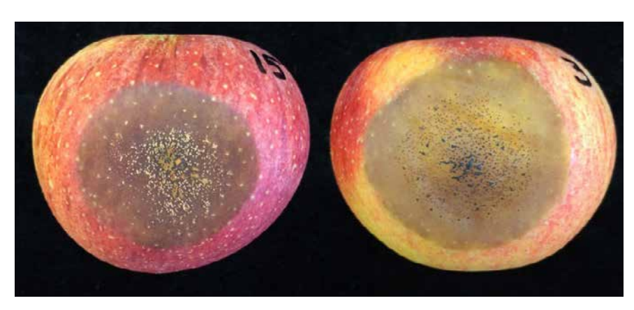
FIGURE 5. DIFFERENCES IN APPEARANCE BETWEEN COMPLEXES CAN OFTEN BE OBSERVED BY SPORULATION PATTERNS. SPECIES WITHIN THE C. ACUTATUM COMPLEX PRODUCE ORANGE CONIDIAL (SPORE) MASSES DURING WET CONDITIONS (LEFT), WHILE C. GLOEOSPORIOIDES COMPLEX SPECIES DEVELOP BLACK ACERVULI (FRUITING STRUCTURES) AND NO ORANGE CONIDIAL MASSES (RIGHT).

When weather warms, fungi produce fruiting structures (acervuli) on the surface of plant tissues. During wet conditions, these structures absorb water and release infective spores (conidia). Some species