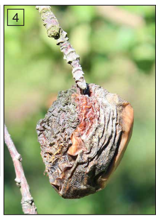
FIGURE 4. INFECTED FRUIT MAY REMAIN ATTACHED TO TREES AS MUMMIES AND SERVE AS INOCULUM SOURCES FOR SUBSEQUENT SEASONS.

individual species, respectively. Previous literature (and some current publications) reference species complex instead of the specific species within the complex. To date, 12 individual species of Colletotrichum have been identified as fruit rot pathogens in the Southeastern U.S. (TABLE 1). In Kentucky, six individual species are known to cause apple bitter rot. Species identification is important because individual species exhibit differences in: