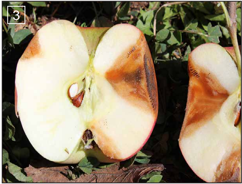
FIGURE 3. INTERNAL V-SHAPED ROT IS AN IDENTIFYING CHARACTERISTIC OF BITTER ROT.

FIGURE 4. INFECTED FRUIT MAY REMAIN ATTACHED TO TREES AS MUMMIES AND SERVE AS INOCULUM SOURCES FOR SUBSEQUENT SEASONS.