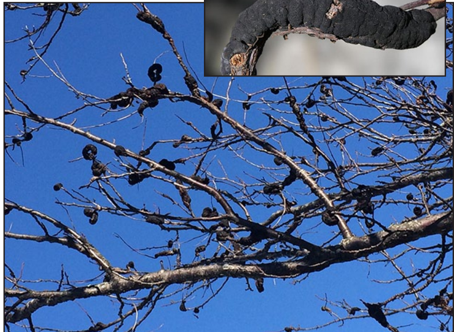
FIGURE 1. BLACK KNOT DISEASE IS EASILY RECOGNIZED BY THE BLACK KNOTTY GROWTHS ON TWIGS AND BRANCHES.

Black knot is aptly named for the conspicuous black knotty growths that form on infected branches (FIGURE 1). Initially, however, these irregular swellings or knots are small and light brown (FIGURE 2). One year after infection, the enlarging knots become olive-green with a velvety surface. As the season progresses, swellings harden, become brittle, and turn black in color (FIGURE 3), reaching lengths of 6 inches by the end of the growing season. Often only one side of a limb is affected (FIGURE 4); but, in some cases, limbs may become completely encircled. Knots continue to expand each year until girdled branches eventually die.