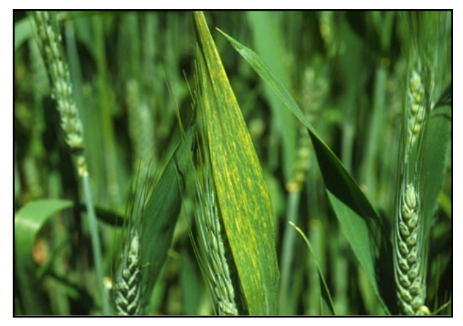
FIGURE 1. SYMPTOMS OF WHEAT SPINDLE STREAK VIRUS.

WSSMV symptoms are highly variable, depending on the wheat variety and growing conditions. At crop "green-up" (typically, mid- to late March) random yellow to light green dashes running parallel to the leaf veins occur on foliage (FIGURE 1). With age, some dashes will be pointed at one or both ends and may have an island of green tissue in their center (FIGURE 2). These classic "spindle"-shaped lesions give the disease its