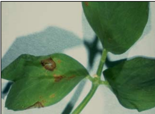
FIGURE 3. EARLY FOLIAR INFECTIONS DUE TO RHIZOCTONIA

Characteristically, dead leaves stick to neighboring leaves and stems because hyphal strands hold them in place. During morning dews, these cobwebby fungal strands may be evident on infected tissues.