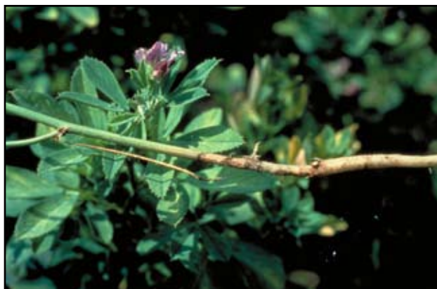
FIGURE 1. RHIIZOCTONIA STEM CANKER

Taproots may exhibit brown to black cankers when invaded by Rhizoctonia solani . Another species, Rhizoctonia crocorum , causes