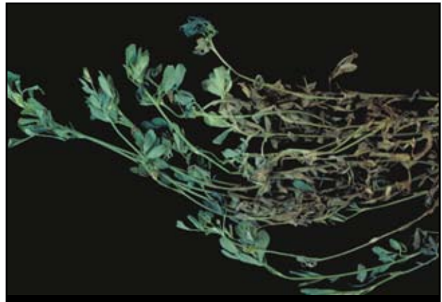
FIGURE 4. SYMPTOMS CHARACTERISTIC OF WEB BLIGHT

Rhizoctonia diseases of alfalfa are quite common in Kentucky, as our warm, humid climate is very favorable for these fungi. Poor drainage and excessive top growth can also encourage disease development. Undecomposed organic matter, particularly if it is high in nitrogen, is another factor which may promote Rhizoctonia diseases. For example, these diseases are sometimes more severe where sod is plowed under or where manure is spread during warm, humid weather.